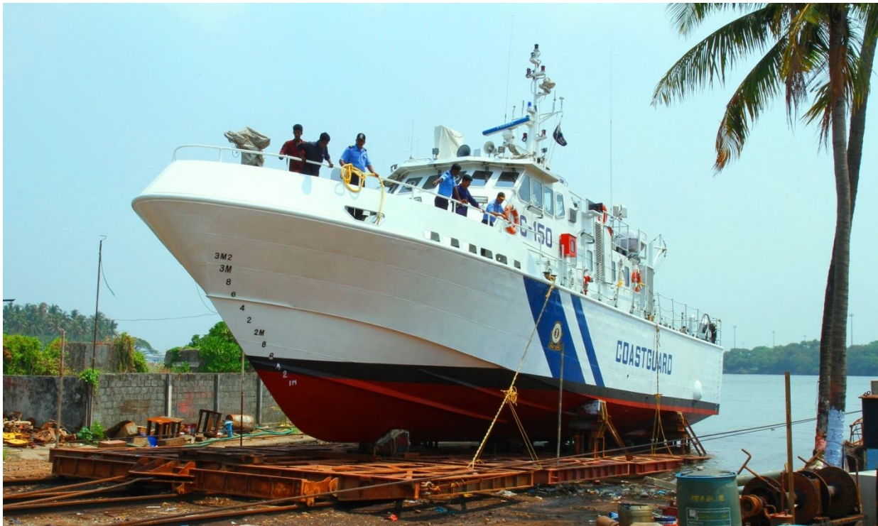
Refit of ICGS C-150 (IB Class) 28Meter LOA (Indian Coast Guard)