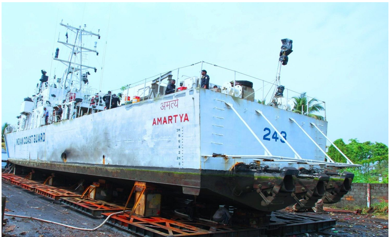
Short refit of vessel ICGS Amartya (FPV Class) 50m length of Indian Coast Guard