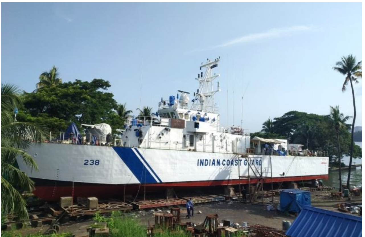
Medium refit of vessel ICGS Abhinav (Fast Patrol vessel) of 300 T and 50m length of Indian Coast Guard