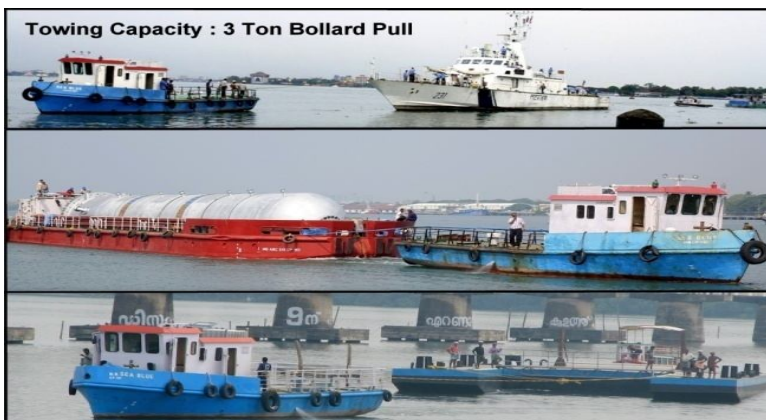
Towing Capacity : 3 Ton Bollard Pull

M.B Sea Blue , a twin-screw Tug boat, is fitted with a Towing hook of capacity 3 Ton bollard pull and can carry cargo upto 20 Tons for delivery at vessels at outer anchorage or distant island areas.