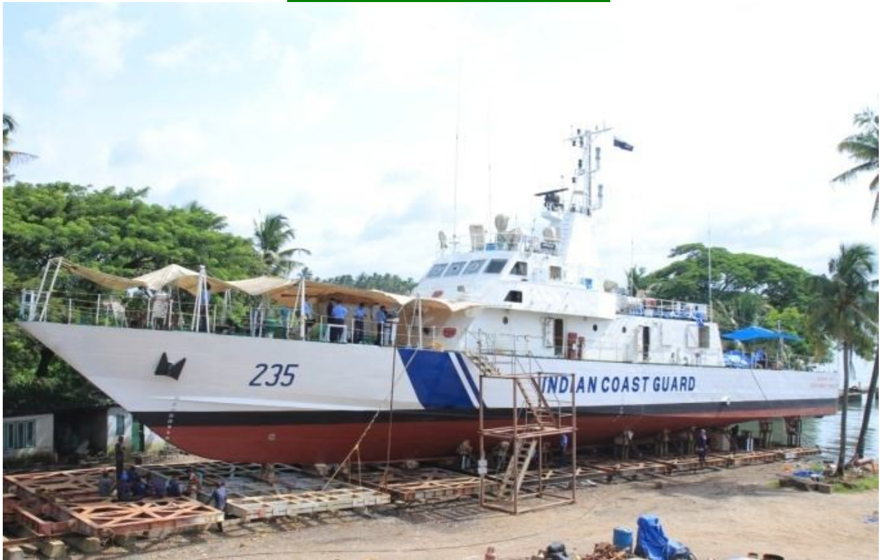
Medium refit of ICGS Savitribai Phule (Fast Patrol vessel) of 300 T and 50m length of Indian Coast Guard