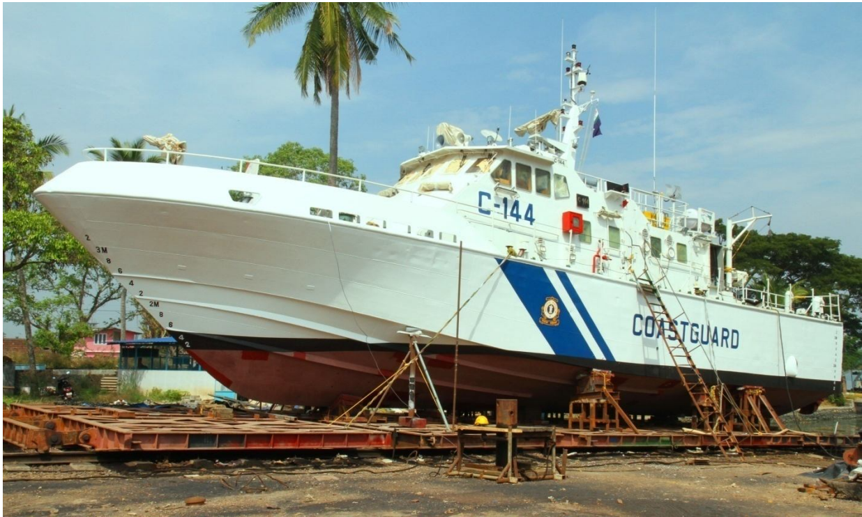
Refit of ICGS C-144 (IB Class) 28m LOA of Indian Coast Guard