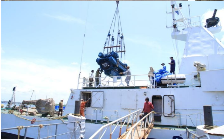
Port and Stbd Main Engine of ICGS Savitribai Phule of Indian Coast Guard being lifted for 1200hourly Routine(Major overhauling) during Medium Refit at SBSL.