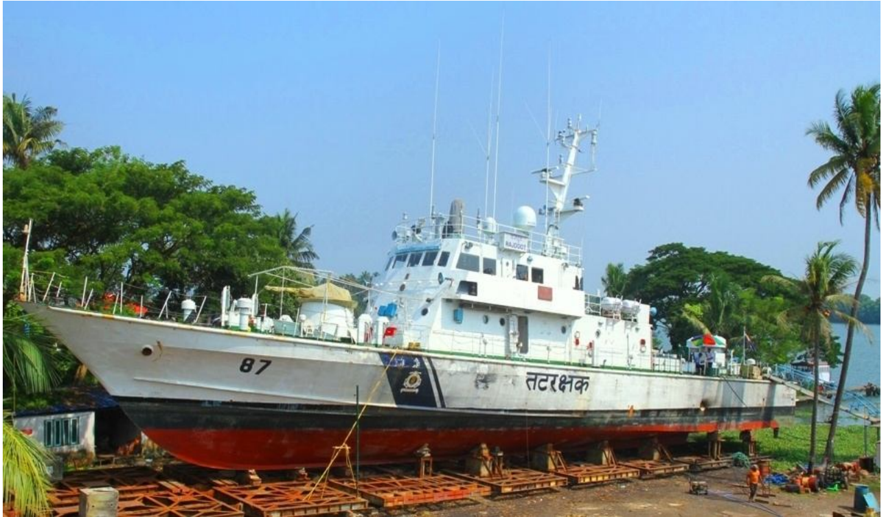
Short Refit of vessel ICGS RAJDOOT (Fast Patrol Vessel) LOA 50 Meters of Indian Coast Guard at SBSL