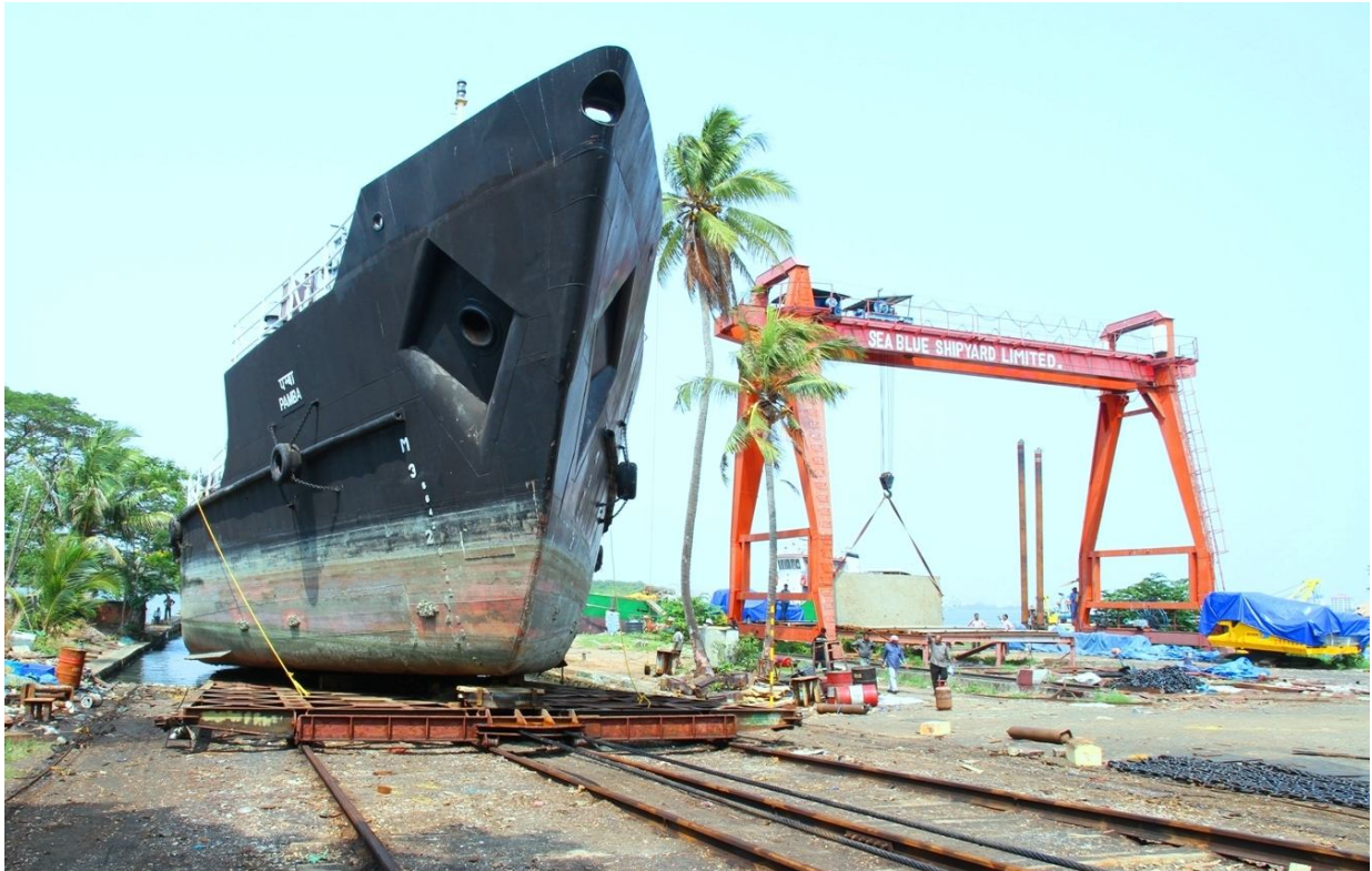
Normal Refit of Water Barge PAMBA of 500 ton and 51 mtr length of Indian Navy at SBSL slipway