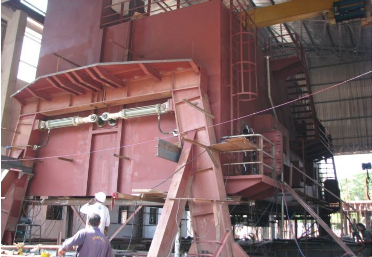
Manufacture and supply of Manhole Covers & Wooden Inclined Ladder for the Vessel INS Vikrant(1 st Indigenous Air Craft Carrier of Indian Navy)