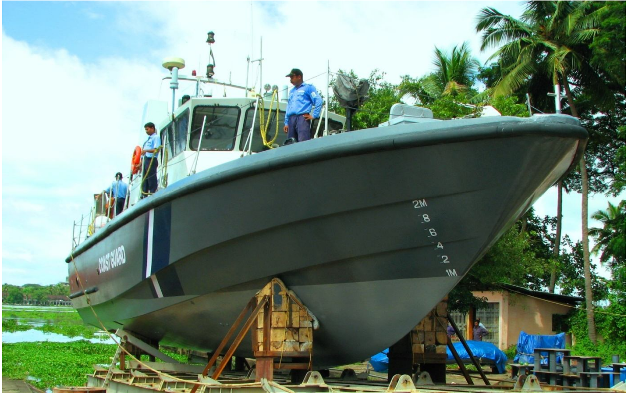
Refit of ICG vessel of Indian Coast Guard