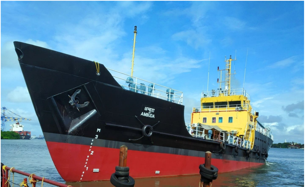
Water Barge AMBUDA of 500 ton and 51 mtr length after Dry dock Repair (Indian Navvessel)