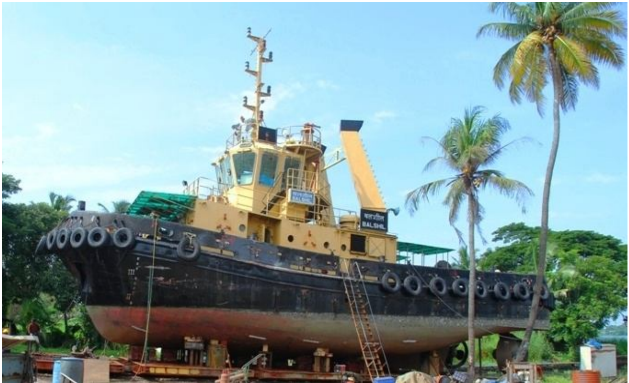
Short Refit & Allied Repairs of TUG SRP BALSHIL