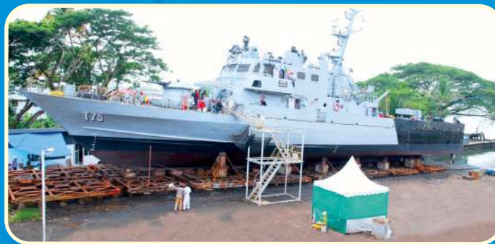
▲ Short Refit (SR-22) & Repairs of INS Kalpeni at SBSL Mechanised Slipway