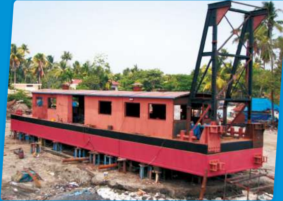
Design, construction and delivery of Cutter suction dredger D-VIII for Kerala Irrigation Dept.