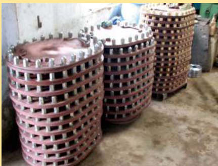
Fabrication and supply of Manhole Cover for India's first ADS built at CSL