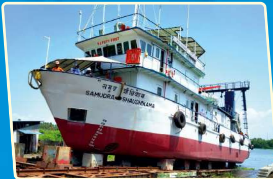
▲ Annual Survey and dry dock repairs of RV Samudra Shaudhi Kama at SBSL Slipway