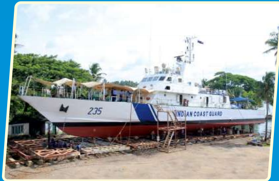
▲ Medium Refit (MR-15) & Repairs of ICGS Savitribhai Phule at SBSL Mechanised Slipway