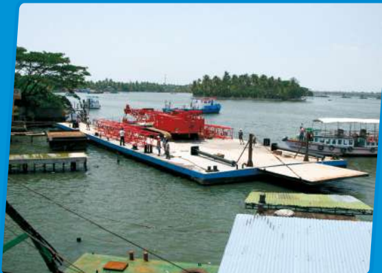
Design, construction and delivery of 250 Ton Case Driving Barge for M/s. Soma Enterprises