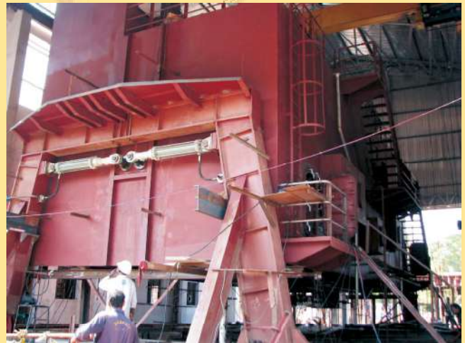
Fabrication, erection and commissioning of Damage Control Training Facility (DCTF) for Indian Navy