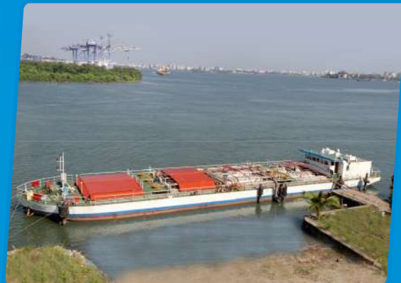
Design, Construction and supply 51.44M (LOA) & 417 Ton (GRT) self-propelled Liquefied Ammonia Gas Transporting Barge for Fertilizers and Chemicals Travancore Ltd