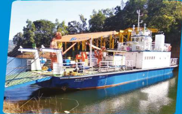
Design, Construction and Delivery of Ro-Ro Barge MV Kurathi for Naval Physical & Oceanographic Laboratory (NPOL) Kulamavu