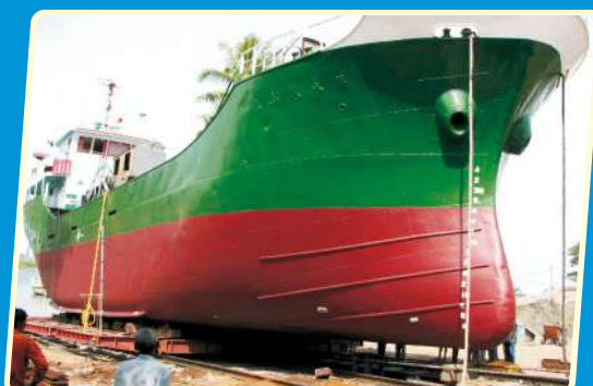
▲ Dry docking and special survey of MV VB Progress at SBSL Slipway.