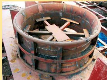
Fabrication and supply of Kort Nozzle