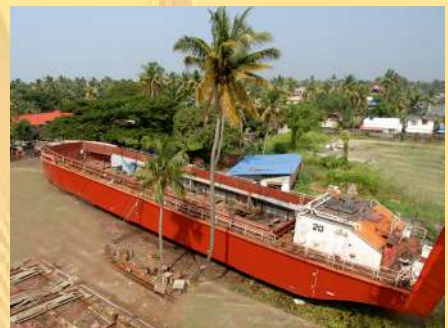
Conversion of LAG Barge to DH Barge at SBSL Slipway