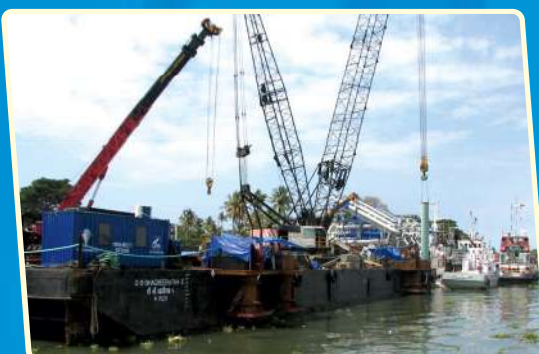
▲ MV Bhageeratha at Wharf for afloat repairs, loading and assembling of 125 Ton Crane and Spud bracket at SBSL Wharf.