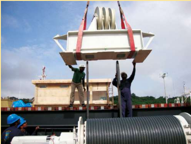
Erection, commissioning and annual maintenance of ship lift system ( Bosch Rexroth, Holland ) at GSL, Goa.